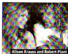
Alison Krauss and Robert Plant